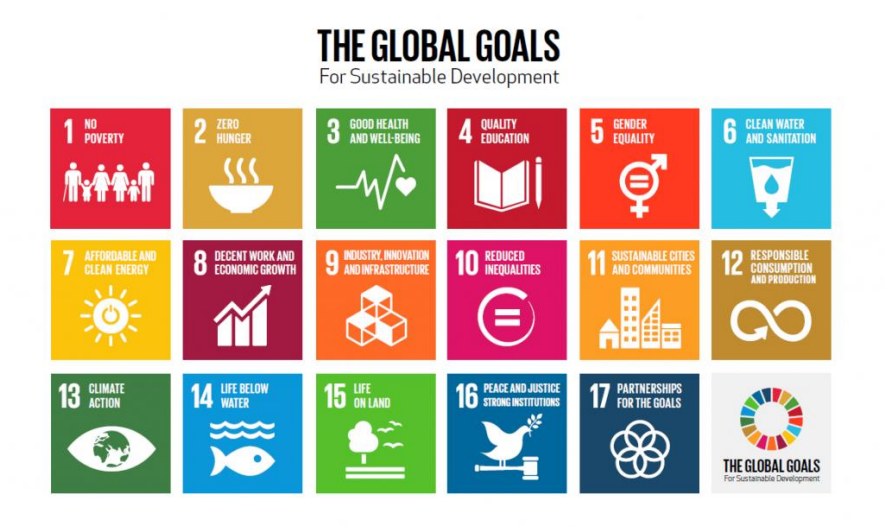
Figure 2: The Sustainable Development Goals Source: Jakob Trollbäck

As well as being more all-encompassing than the MDGs, the consultation process was also much more inclusive - Ban Kimoon called it the "most transparent and inclusive process in UN history". An unprecedented effort was made to get the input of as many people as possible, particularly those who wouldn't normally be consulted for this type of international agreement. In total, 5 million people from across 88 countries in all the world's regions took part in the consultation, and shared their vision for the world in 2030. This is very different from the